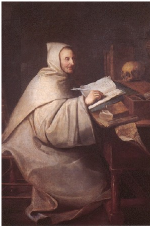
Armand Jean le Bouthillier de Rancé, the founder of the Trappists

The Trappists, also known as the Order of Cistercians of the Strict Observance, are a Catholic religious order of cloistered monastics that branched off from the Cistercians. They are part of the larger Cistercian family that traces its origin to 1098. Trappists seek to let go of daily distractions to free the mind and heart for deep contemplation of God. Their activities and attire are simple and humble, and their grounds are profoundly silent except for purposeful speech, quiet chant, and the sounds of nature. They are lovers of place and find blessings in union with and stewardship of creation. 1 The Trappists follow the Rule of St. Benedict and consist of both monks and nuns, with the nuns known as Trappistines. Most Trappist monasteries produce artisanal goods, the most famous of which is Trappist beer.